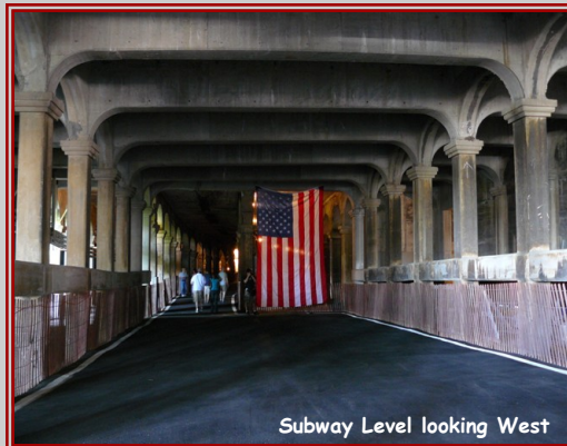
Subway Level looking West

had some of the dogs visit the tour but it was much too hot for the dogs to be out in 98 degree weather. Past enthusiasm shown by thousands of Greater Clevelanders for the past 11 years who already experienced our bridge and subway tours pro-