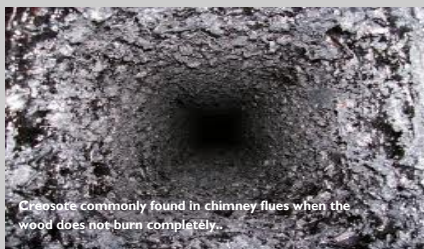
Creosote commonly found in chimney flues when the wood does not burn completely.

problems (cracks, and structural damage) are not visible